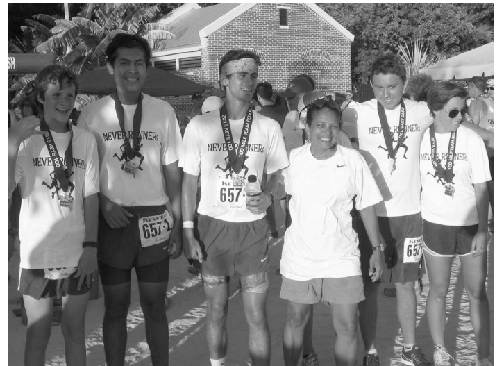
KEYS 100 - Never Runners Team

Great Race and Finish line. Thanks to all the volunteers from the club and friends that helped from Saturday through Sunday afternoon. Many Key's Teams finished, running this long and popular event.