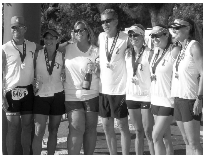
KEYS 100 - Lazy Dog Team